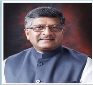
Hon'ble Shri Ravi Shankar Prasad Former Union Minister of Law & Justice; Electronics & Information Technology; and Communications Government of India