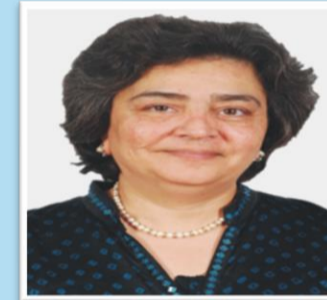
Ms Zia Mody Chairperson, CII National Committee on Regulatory Affairs Founder and Senior Partner AZB & Partners